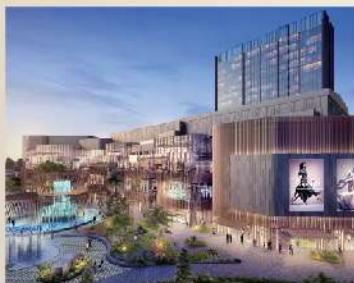
BINTARO JAYA XCHANGE MALL TAHAP 2