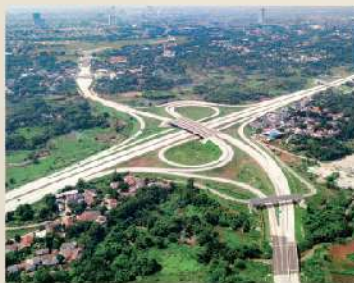
SIMPANG SUSUN TOL PARIGI