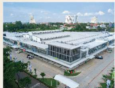
FRESH MARKET BINTARO JAYA