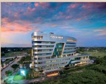
RUMAH SAKIT PONDOK INDAH BINTARO JAYA