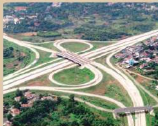
TOL SIMPANG SUSUN PARIGI