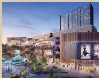
BINTARO XCHANGE MALL