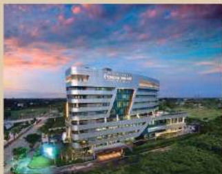
RUMAH SAKIT PONDOK INDAH BINTARO