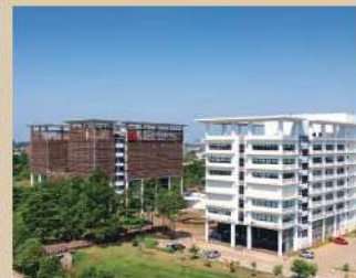
UNIVERSITAS PEMBANGUNAN JAYA